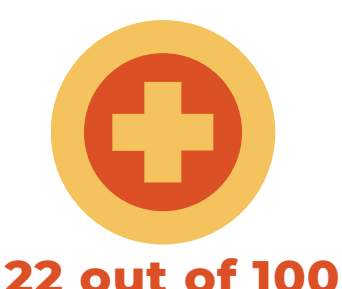
A&E attendances prevented